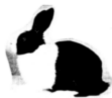
Figure 1 A copper-deficient rabbit, showing a graying of genetically black hair. There later develops a severe anemia (S. E. Smith, Cornell University).