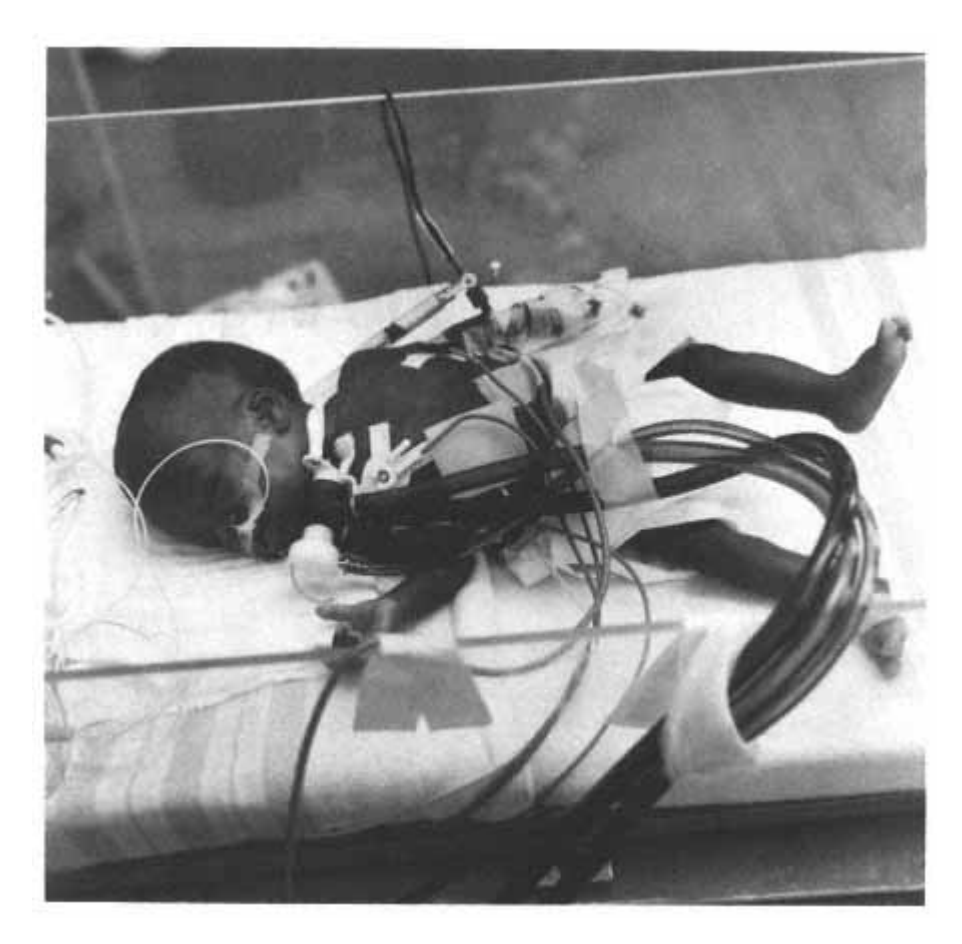
MARCH OF DIMES BIRTH DEFECTS FOUNDATION

possible pathogenic mechanisms, but the underlying physiological processes have not been identified.