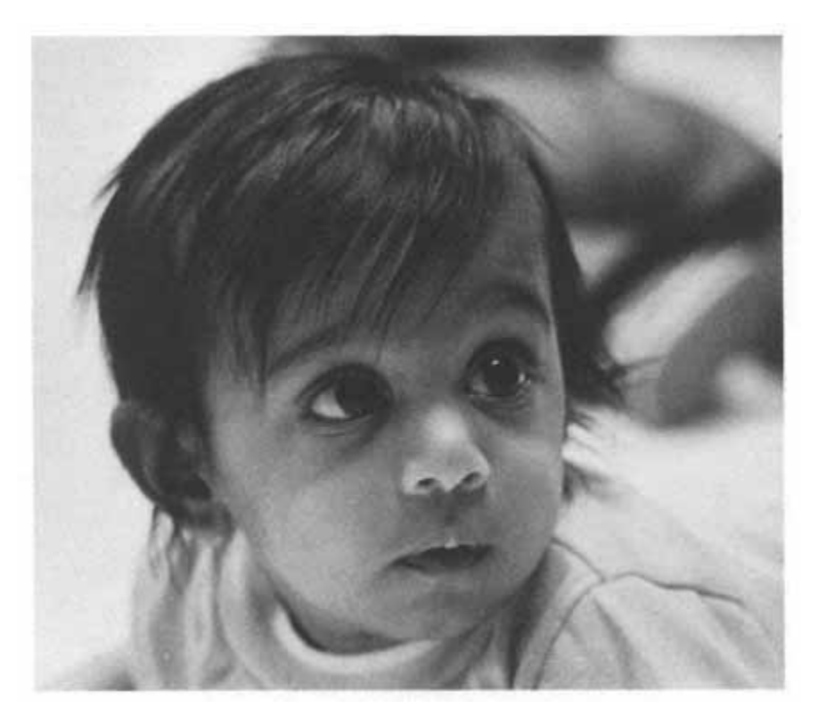
MARCH OF DIMES BIRTH DEFECTS FOUNDATION