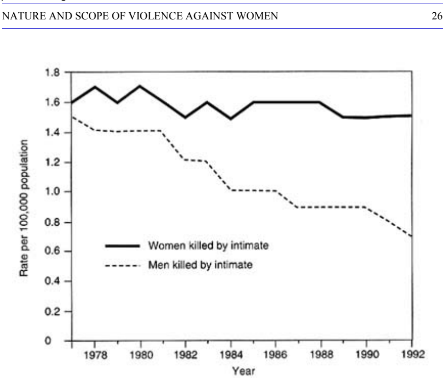
FIGURE 2-1 Rates of homicide by relationship to offender. NOTE: Intimate includes spouse, ex-spouse, and boyfriend or girlfriend. SOURCE: Bureau of Justice Statistics (1994:9)