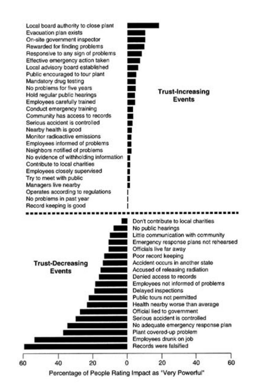
FIGURE 4.2 Differential impact of trust-increasing and trustdecreasing events. NOTE: Only percentages of Category 7 ratings (very powerful impact) are shown here.