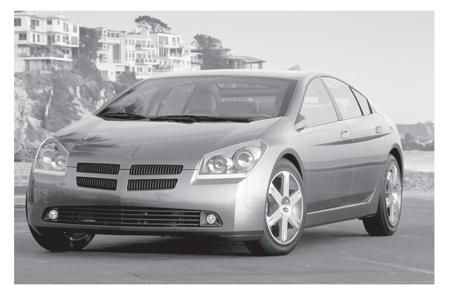
FIGURE 4-3 The DaimlerChrysler ESX3 concept vehicle.

to supply a DC brushless, permanent-magnet motor instead of a three-phase induction machine. Its six-speed manual transmission has two clutches to smooth shift transitions.