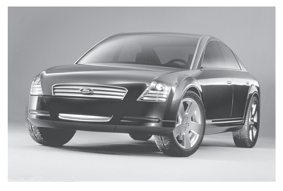
FIGURE 4-2 The Ford Prodigy concept vehicle. Source: Ford Motor Company and USCAR.

69 in (1,755 mm), a curb weight of 2,385 lbs (1,083 kg), and an aerodynamic drag coefficient of 0.199.