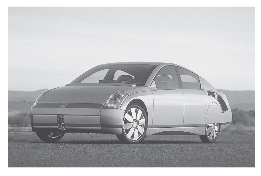
FIGURE 4-1 The General Motors Precept concept vehicle.

requires an air compressor, a humidifier, a heater for releasing the hydrogen, a coolant pump, and several heat exchangers. Packaging all of these components without infringing on vehicle utility presents a major challenge. The Precept fuelcell vehicle shown to the public demonstrates that this packaging can be accomplished. An operating version of this vehicle is anticipated by the end of 2000.