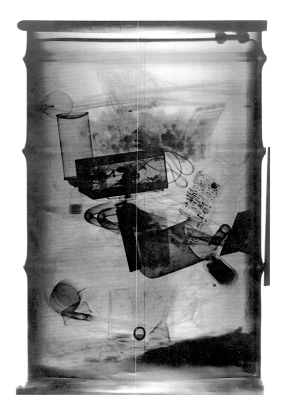
FIGURE 3.1 X-ray examination of a waste drum allows operators to determine if it contains prohibited items that must be removed before shipping the waste to a disposal site. Such visual inspection of a drum, at various positions and angles, may take several hours.

some additional characterization will be required to validate the process knowledge (St. Michel and Lott, 2002).