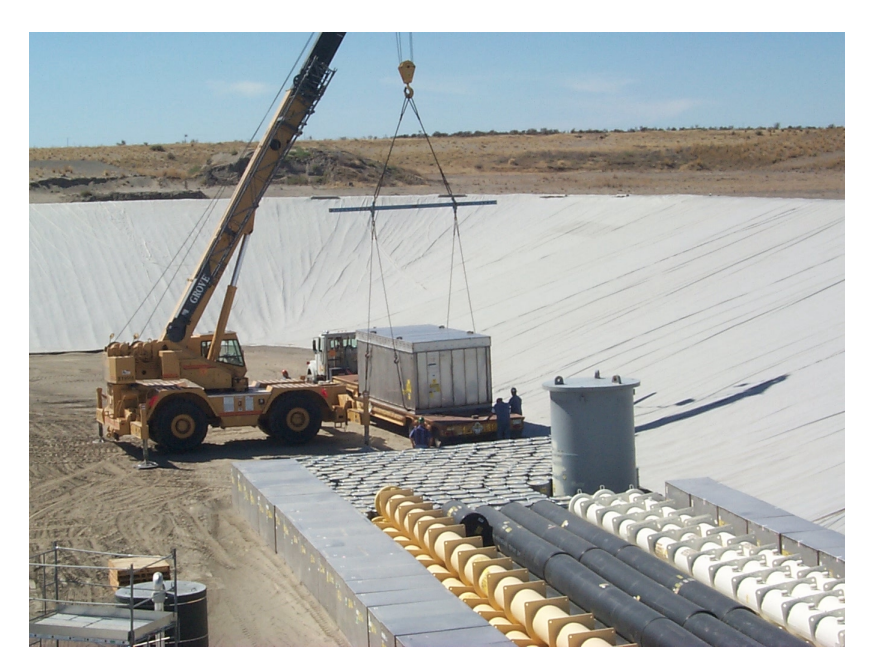
FIGURE 2.4 RCRA requirements for disposal of MLLW include use of an impermeable liner and leachate collection system to provide total containment of hazardous chemicals for at least 30 years. Here, a large box of macroencapsulated waste is being placed in a RCRA-compliant disposal facility at Hanford.

SOURCE: Code of Federal Regulations, Title 10, Part 61.55.