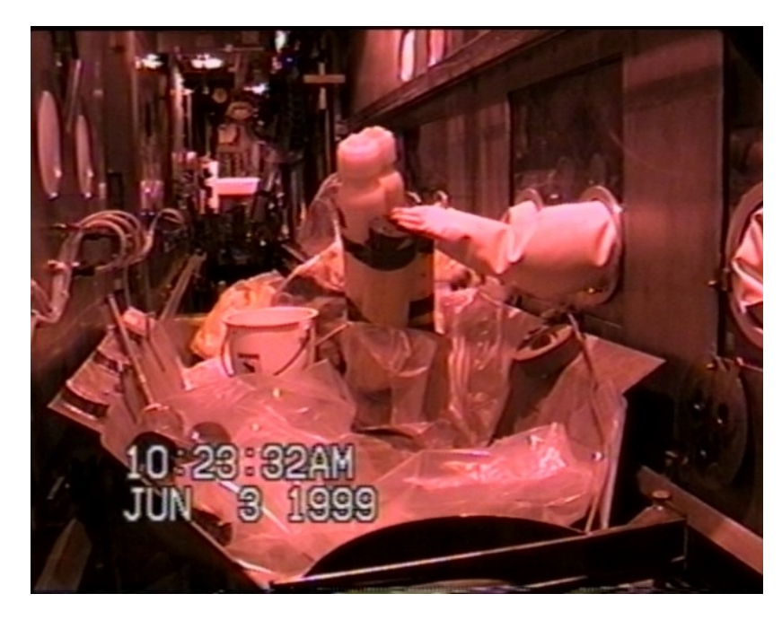
FIGURE 2.3 Manual sorting of waste inside a containment (glovebox) facility is required to remove items that are prohibited by shipping or disposal restrictions. Sorting and repacking the waste are time-consuming, expensive, and present risks to workers.

spray cans, which are often found in waste drums) cannot be accepted at the WIPP, and they are removed by sorting through the waste (see Figure 2.3). Waste that is contaminated with polychlorinated biphenyls (PCBs), about 1 percent of the inventory, cannot currently be accepted by the WIPP.