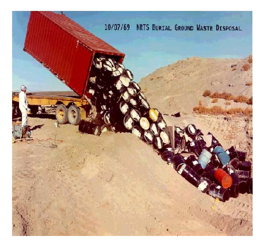
FIGURE 2.1 Before 1970, transuranic and mixed wastes were buried in nearsurface trenches. The waste was considered to be permanently disposed, and inventory data are lacking.