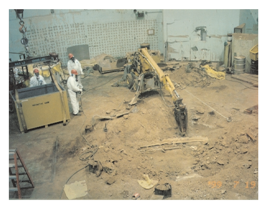
FIGURE 3.2 The BROKK demolition machine, equipped with a robotic arm, is an example of state-of-theart technology that might be used to retrieve buried waste from Pit 9 at INEEL.

radioactive waste, are inexpensive and versatile for repackaging excavated objects or wastes that have somewhat irregular sizes and shapes. They can also be used to containerize both clean and contaminated soil associated with the retrieval activities.