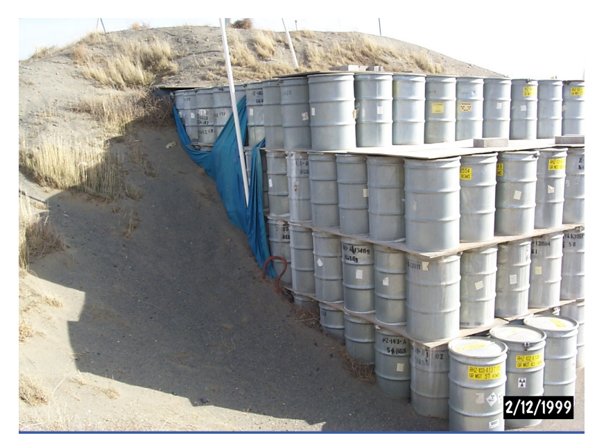
FIGURE 2.2 Since 1970, DOE has required that sites store TRU waste so that it can be retrieved easily. TRU wastes at Hanford, which is in a very dry region, are stored in earthen mounds.

from leaks. DOE recognizes that some of these soils and sediments are sufficiently contaminated to warrant retrieval and describes these as "ex situ contaminated media" in its summary report. If they are retrieved, both the pre-1970 buried waste and the ex situ media will be considered newly generated waste (DOE, 2001a).