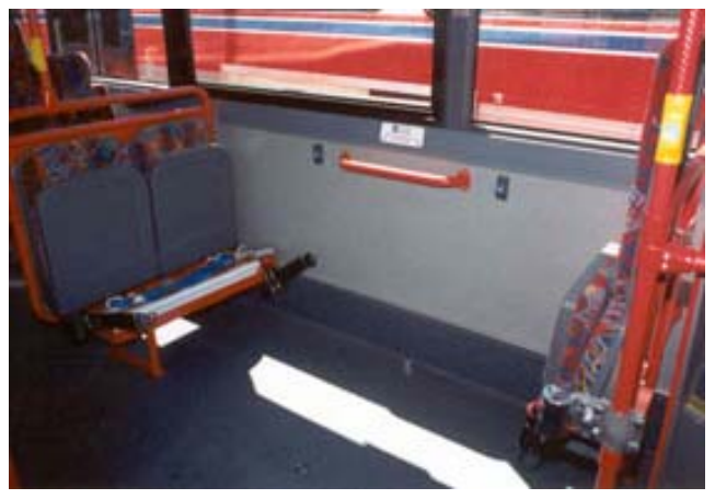
FIGURE 19 Combi system roadside in double-decker BC Transit low-floor bus.

wheelchairs and scooters in this position. Examples of the Combi 2 system are shown in Figures 18 and 19.