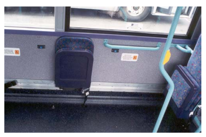
FIGURE 6 BC Transit rear-facing position with flip-down seats on bus wall and back panel.