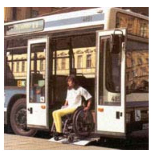
FIGURE 9 Access over ramp at front door (Germany).

The remaining task in providing accessible transportation by bus was to answer the question of whether the safe transport of wheelchair passengers required special measures in transit buses, and what would be necessary to secure or restrain wheelchair passengers. One specific aspect was the choice between forward and rear-facing options for positioning the wheelchair within the bus.