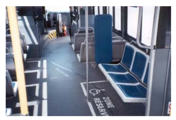
FIGURE 4 Montreal (Société de Transport de Montréal) rearfacing position adjacent to rear door, with stanchion to prevent tipping, designated priority markings on floor, and flip-up bench seating.

Flip seats can be positioned in the wheelchair area as long as their dimensions do not interfere with the clear space required for the wheelchair (Figures 4–7). A sign in that area indicates that the seats must be vacated if a passenger in a wheelchair or scooter needs to occupy the space.