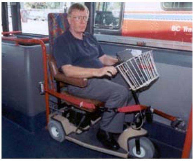
FIGURE 16 Two straps hooked together wrap around scooter in rear-facing position to prevent tipping, moving into the aisle, or rearward movement on BC Transit bus.