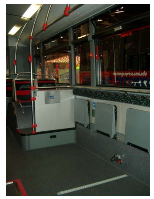
FIGURE 20 Forward-facing position (combi design) on prototype AC Transit BRT service bus.

Two securement stations are located on the same side of the bus, with easy access via a ramp in the second door. This eliminates the entry area constrictions common to traditional front boarding designs. The forward-facing securement area uses traditional strap-type securements (Figure 20). The adjacent rear-facing station features a padded backrest with grab rails, and seat belts (Figure 21). This design is intended to provide "containment" in the event of sudden stops or crashes, instead of relying solely on straps to hold the wheelchair in place.