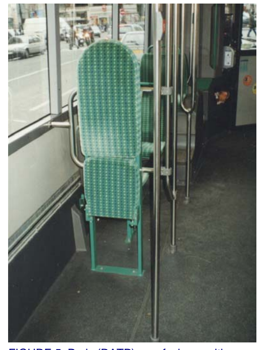
FIGURE 5 Paris (RATP) rear-facing position with flip-down seat built into back panel.

The location of rear-facing positions varies depending on the bus design. They are typically located immediately behind the front wheel wells for bus models with wheelchair access through the front door, or toward the middle section of the bus for bus models accessible through the middle or rear door.