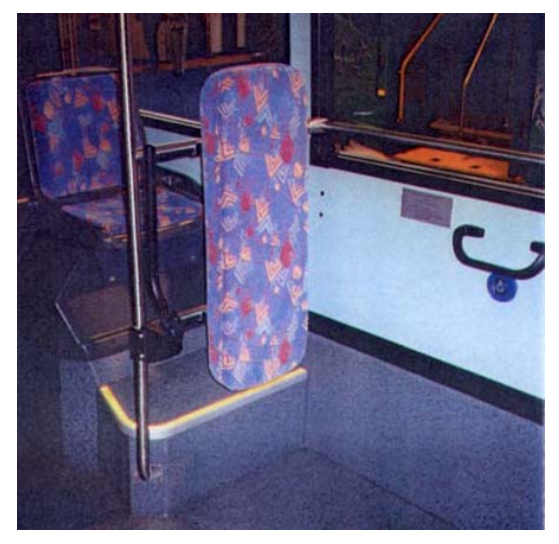
FIGURE 3 Rear-facing position with movable armrest (shown in up position). Instead of stanchion, there is a handrail on the wall and a separate stop request button (located below the handrail).

Flip seats can be positioned in the wheelchair area as long as their dimensions do not interfere with the clear space required for the wheelchair (Figures 4–7). A sign in that area indicates that the seats must be vacated if a passenger in a wheelchair or scooter needs to occupy the space.