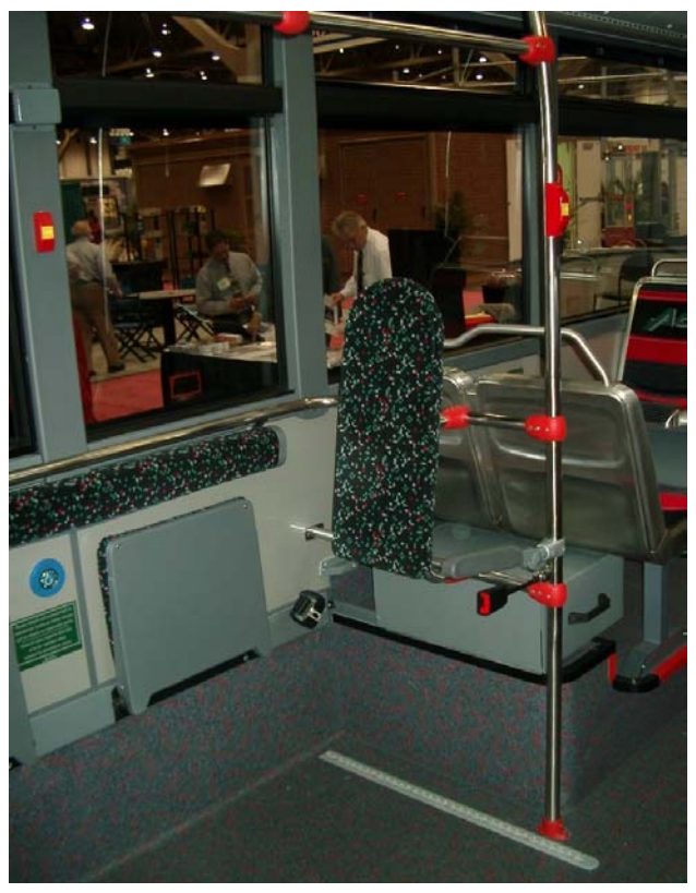
FIGURE 21 Rear-facing position (combi design) on prototype AC Transit BRT service bus.

The rear-facing station is configured to also use ADA-style securement straps, and to be used as an optional forward-facing station in cases where passengers are not able to ride "backward" for health reasons. In this instance, strap-type frame securements are to be clipped into the floor for ADA-compliant securement. Time will tell whether this option is necessary.