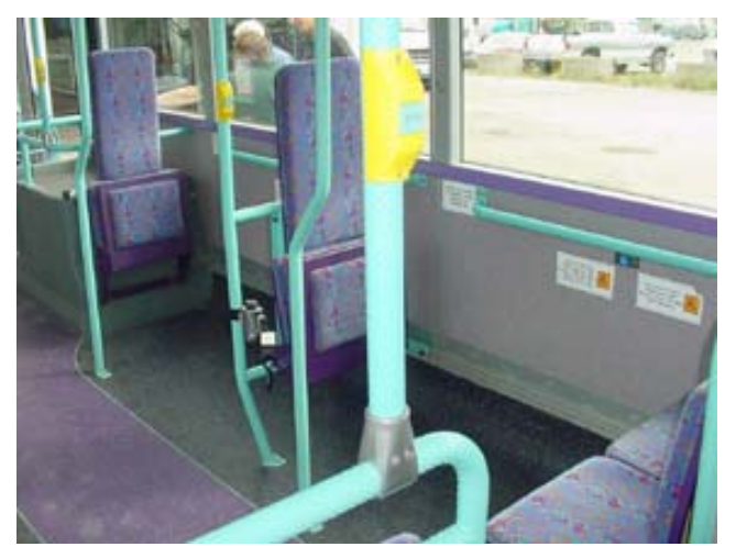
FIGURE 13 Two rear-facing systems in tandem at curbside in 9-m (30-ft) BC Transit low-floor bus.

the aisle. There are additional retractable straps to carry out the same function, but their use is optional, and not mandated. The straps provide additional safety, especially for passengers who lack the upper body strength to hold on to the handrails and stanchions provided. Both positions have a flip seat at each back panel, but no flip seats along the wall. This allows for the placement of stanchions as close as possible to the wall, to minimize interference with passenger flow in the aisle. Rear-facing flip seats for other passengers also help to minimize the negative image associated with wheelchair passengers' being the only passengers facing to the rear.