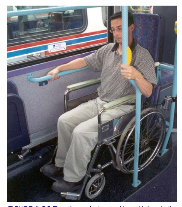
FIGURE 2 BC Transit rear-facing position with handrail and separate stop request button (located on wall below handrail).