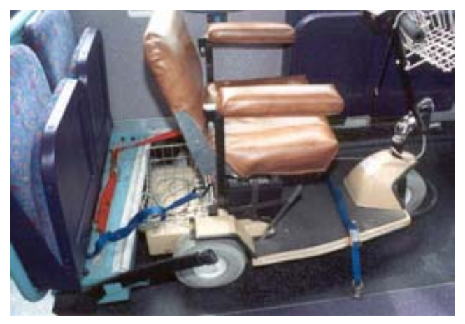
FIGURE 11 Forward-facing position in combi design, with two rear tie-downs and one strap over the footrest of the scooter.