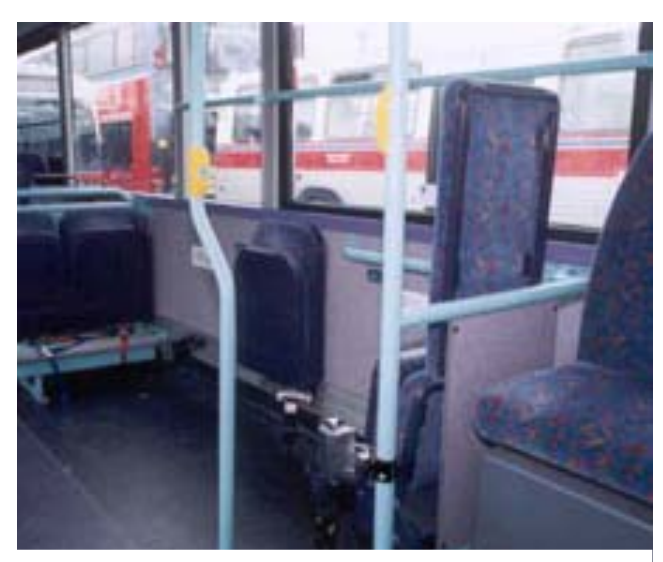
FIGURE 14 Combi system of forward and rear facing in one location, 10.6-m (35-ft) BC Transit low-floor bus (future standard for all buses).

Transit is the only transit system in Canada to have experimented with and adopted this design.