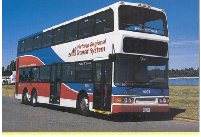
FIGURE 12 Transit double-decker bus.

The 9-m (30-ft) low-floor bus is equipped with two rear-facing positions in a tandem configuration at curbside (Figure 13). Both positions have an aisle stanchion to prevent the tipping and moving of wheelchairs or scooters into