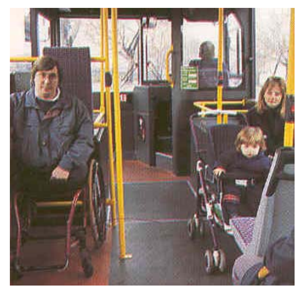
FIGURE 1 Transport for London rear-facing position with back panel and aisle stanchion.

alert is important, because the operator needs to advise boarding passengers and apply the ramp first.