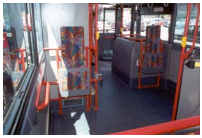
FIGURE 18 Double-decker BC Transit low-floor bus: Combi system roadside, one rear-facing system curbside.

The Combi 2 design is installed in 10.6-m (35-ft) low-floor buses, roadside. On the opposite side are aisle-facing flipup seats, allowing for generous maneuvering room for wheelchairs and scooters. Combi 2 consists of one forward- and one rear-facing system, with both systems capable of being used at the same time for two travelers in wheelchairs and scooters (Figure 17). In this configuration, the longitudinal distance between the two systems is 2.02 m (80 in.). On the wall adjacent to the forward-facing system are flip seats. The rear-facing system has a flip seat incorporated into its back panel, and it has a fixed aisle stanchion. There are also two retractable straps for use by