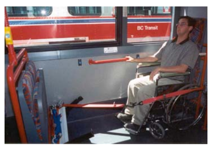
FIGURE 15 Combi 1 design on BC Transit double-decker bus with front- and rearfacing design in same position, and hooked straps to prevent tipping.

The Combi 1 design is used by BC Transit on its 12-m (40ft) double-decker low-floor buses (Figure 15). Because of space limitations, it has no aisle stanchion to provide maximum space for wheelchairs to maneuver in and out of position. Instead, the rear-facing position has one retractable strap mounted at the vertical back panel aisle support at about seat height, and another retractable strap mounted at the wheel stop on the wall side. The two straps are hooked together to prevent the wheelchair from tipping or moving into the aisle, or they are connected directly to the wheelchair. The use of the straps is optional. The system was tested and meets or exceeds a dynamic force of 3 gtoward the front and a recoil force of up to 1 g toward the rear. The same hooked strap system is used on the single rear-facing position on the opposite wall (Figure 16). The longitudinal distance between the forward- and rear-facing