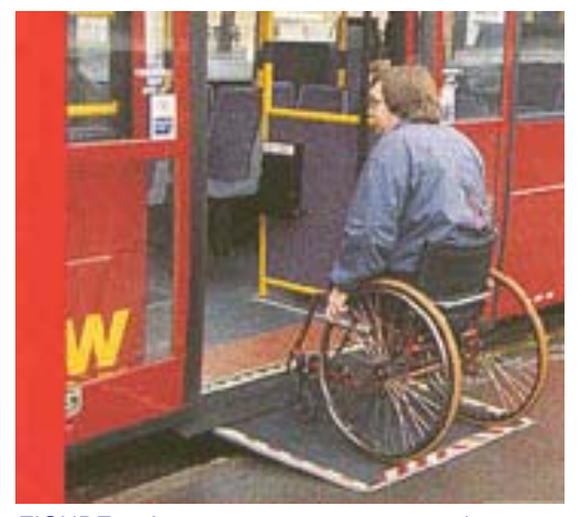
FIGURE 8 Access over ramp at center door (United Kingdom).

A total systems approach was pursued through a variety of research and demonstration efforts (10). In addition to improving bus design by reducing the height of the bus floor level and introducing the bus kneeling feature, efforts also explored improved stop design by raising curb height and reducing horizontal gaps through bus docking systems, both manual and electronic. Telescopic and flip ramps were developed for use either at the front or center door of the bus to overcome any remaining vertical and horizontal gaps (Figures 8 and 9).