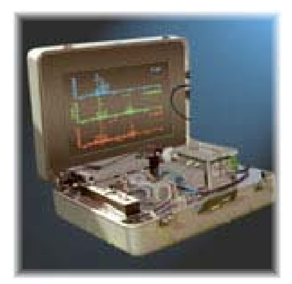
FIGURE 2-2 Miniaturized mass spectrometer for bio-chem defense. The Johns Hopkins University Applied Physics Laboratory (APL) has developed a miniaturized time-of-flight mass spectrometer built into a suitcase-sized container for analyzing solids, liquids, and gases in the field.

Opportunities to Improve Airport Passenger Screening