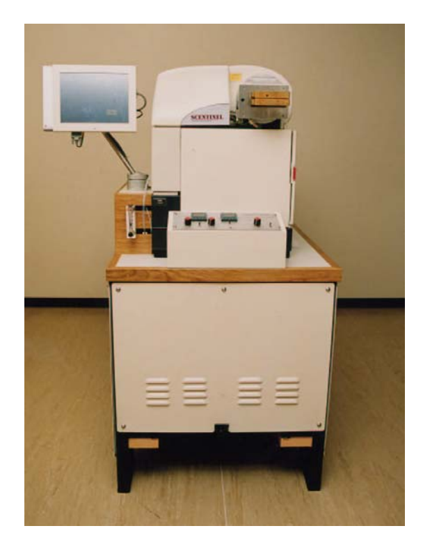
FIGURE 2-1 The as-deployed Scentinel mass spectrometer trace explosives analyzer.

compounds listed on Chemical Weapons Convention schedules.<sup>21</sup> These studies used a low-pressure photoionization/ion trap/TOF mass spectrometer.<sup>22</sup> IMS spectrometers have not been considered for these diverse analysis needs.