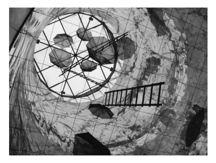
Figure 16 Aethrio (Atrium) by George Zongolopoulos.