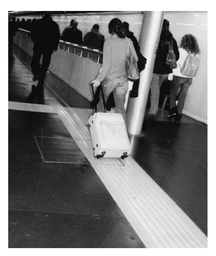
Figure 12 Guideways for the visually impaired at a station in Naples.

Detectable strips/guideways are present throughout the stations in Naples. These rubber strips with grooves guide visually impaired customers to train doors and elevators. The passenger simply slides the cane along the grooves (see Figure 12).