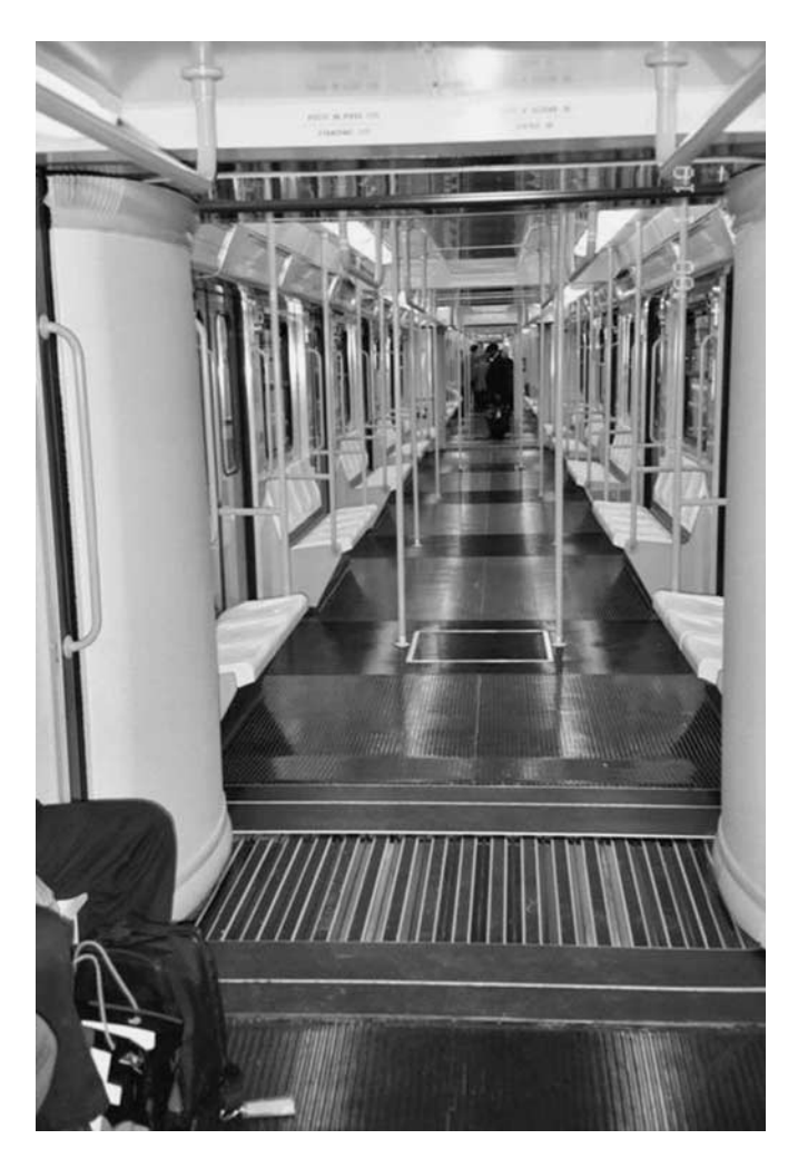
Figure 3 An example of a new articulated car interior in Milan.

structural modifications, including the installation of gangways for full articulation and rooftop air conditioning. One of the goals of refurbishment is to standardize all of the trains so that the cars can effectively be used on any line. These upgrades are expected to add another 20 to 30 years of life to trains that are currently 15 to 20 years old. ATM expects to refurbish approximately 100 trains in the next 5 years.