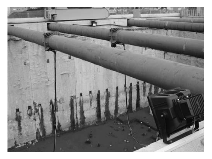
Figure 4 Station open cut in Naples.