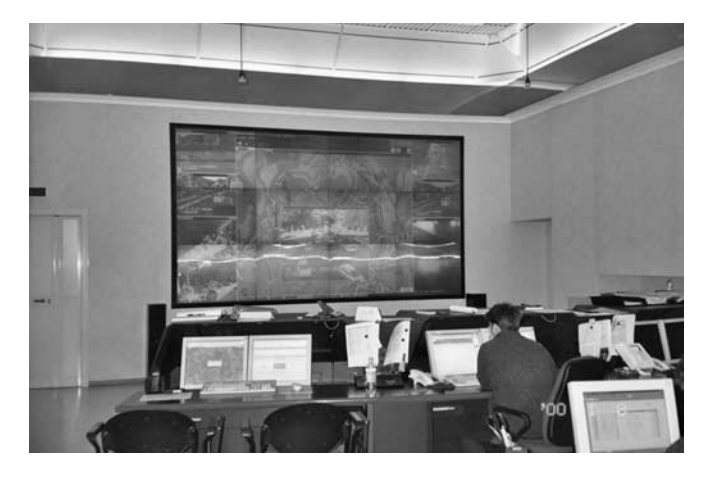
Figure 8 ITS Traffic Control Center managed by STA in Rome, Italy.

Information technology supporting surface modes was also described to the team by ATM. Milan's high degree of functionality in this area and its transit organizational structure has enabled effective service coordination and enhanced customer information between rail and surface modes. The surface control center has the ability to track vehicle locations through a landmark-based system and collect data on vehicle status. In addition, vehicle condition/status data have numerous uses. For exam-