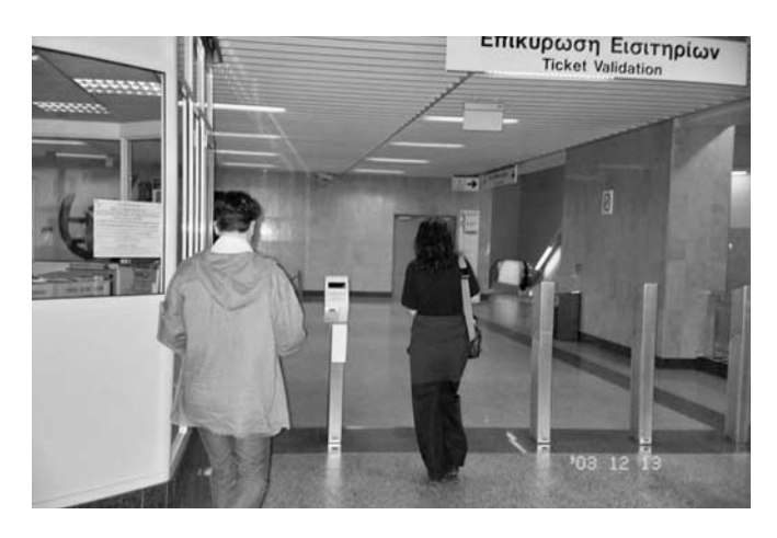
Figure 10 Athens open fare control line for ticket validation.

The fare control system in Rome is a closed design with gated turnstiles. The ticket validation system is time based, and the system is integrated with surface modes.