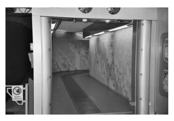
Figure 20 Station smoke/fire barrier in a station in Naples.

Nothing in the Naples metro stations is made out of flammable material, and all stations are constructed to resist earthquakes. Even luggage rooms are built to withstand dynamite. To illustrate the priority of safety at MN, even an art display of three old Fiat automobiles is totally nonflammable; all flammable materials, including the tires, have been retrofitted with appropriate look-a-likes.