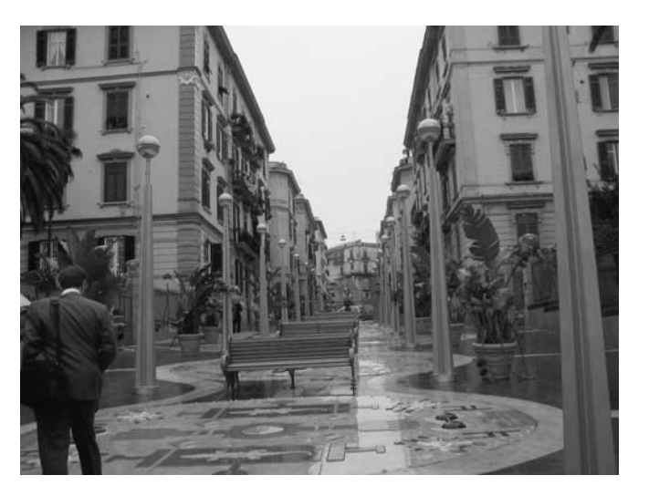
Figure 18 Designs along the pedestrian square at the Materdei station.

The design of the Cilea-Quattro Giornate Station was done by Domenico Orlacchio. Again, traffic was diverted to create a pedestrian area, and much of the art displayed at this station represents the history of Naples' fight for freedom.