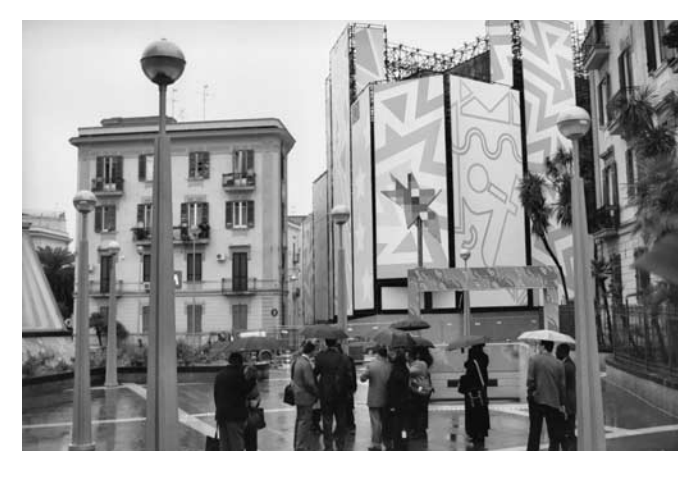
Figure 19 Example of painted buildings surrounding the Materdei station.