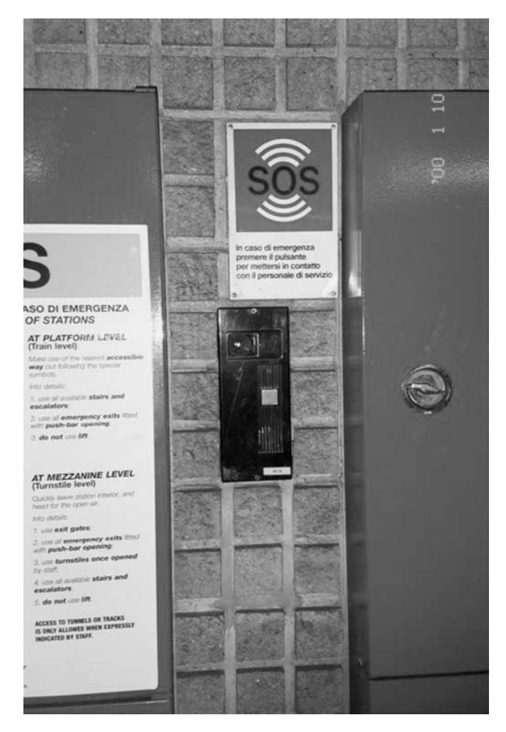
Figure 21 Milan's station SOS intercom.

As a key component to ensuring safety, the agency requires safety training for all operators. The training