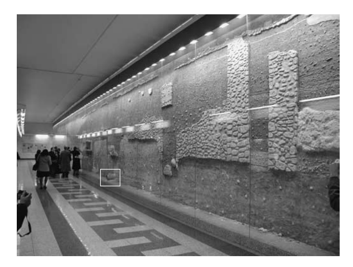
Figure 14 Display at Syntagma station highlighting the different historical eras of Greek civilization. See Figure 15 for an enlargement of the outlined section.

In addition to exhibiting the findings from the excavations, modern artwork by famous Greek artists is on display at 12 stations. Eventually, the art program will be expanded to include all stations. Sculptures, ceramic tiles, silk-screened works, and paintings are located on the platforms, transfer areas, and concourses and outside the stations. A stunning piece of art, Aethrio (Atrium) by George Zongolopoulos, viewed by the team at the Syntagma station, consisted of umbrellas and metal stairs inside a large circular area covered in mirrors (see Figure 16).