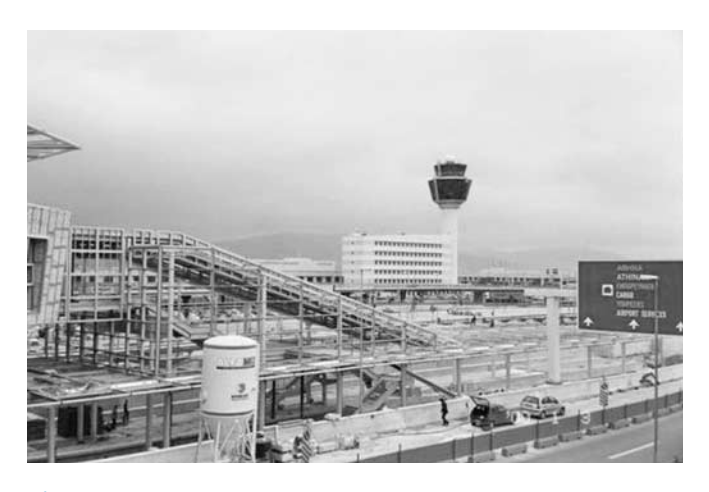
Figure 13 The intermodal airport station under construction.

Intermodal transfers are a key element of AM's immediate and long-range plans for the public transport system. In 2004, intermodal connections will include bus transfers at almost all metro stations, major park-and-ride facilities at five metro stations, interline transfers, intercity rail transfers at Larissa, suburban rail transfer at Plakentras, and tram connections at Sygrou-Fix. By 2007, additional park-and-ride facilities will be constructed, along with a tram connection to a metro transfer point at the site of the old airport. Finally, a metro transfer station at Ag. Savas will connect to the intercity bus terminal.