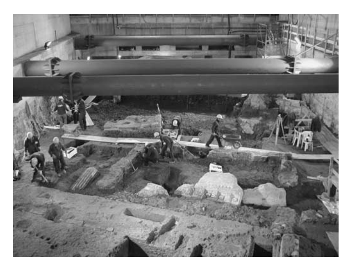
Figure 7 Duomo excavation site.

In Milan, archaeological remains are usually found within 6 to 7 m of the surface. They do not have an impact on construction.