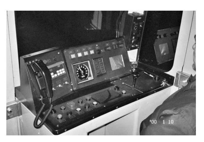
Figure 9 Milan's train operator console.