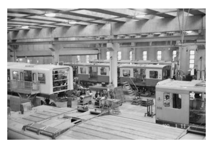
Figure 2 Car remanufacturing with new articulation in Milan.

ATM is also focusing on refurbishing train vehicles (see Figures 2 and 3). New equipment is fully articulated, and older cars are undergoing major