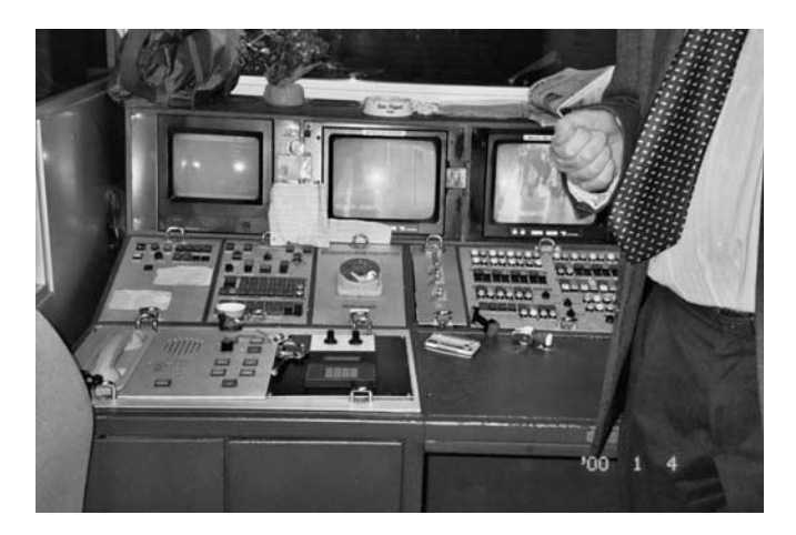
Figure 11 Station manager control booth console.

Station equipment controls for Line 1 in Naples are centralized at the station manager's location. Generally, these booth-type facilities are placed next to the entry control line. The station manager has a direct line of sight of customers entering and exiting the system. The booth has an open appearance, and the manager is readily available for interaction with the customer. Local signal and ROW power indications are provided at the station manager's location, as are comprehensive status indication and control of station equipment systems (see Figure 11). The control function is aided by extensive CCTV, public address, and point-to-point telephone/intercom access located throughout the station complex. Access to most of these systems, including CCTV, is available at the central control center; however, the station manager is expected to act as the first line of supervision and response.