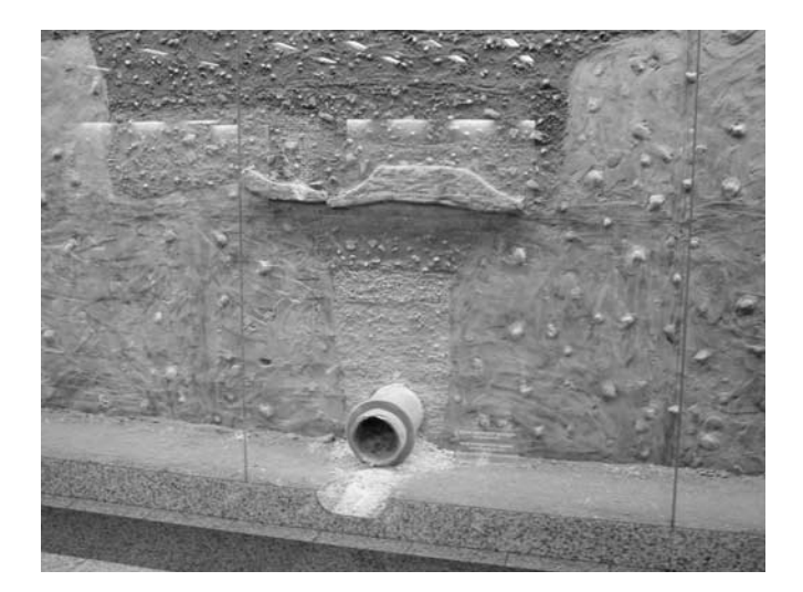
Figure 15 Terracotta pipes from the Pisistratid aqueduct.

International architects were hired for each new station and the architects were given total responsi-