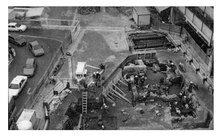
Figure 6 An excavation site in Athens.

Approximately 70,000 sq m have been excavated (see Figure 6), unearthing more than 50,000 archaeological findings dating from the Neolithic period to the modern era. Discoveries include public baths, cisterns, ancient roads, city walls, drains, cemeteries, tombstones, statues, and pots and other household items. For example, an ancient aqueduct was discovered; it has been rebuilt by archaeologists for display at the Monastiraki station.