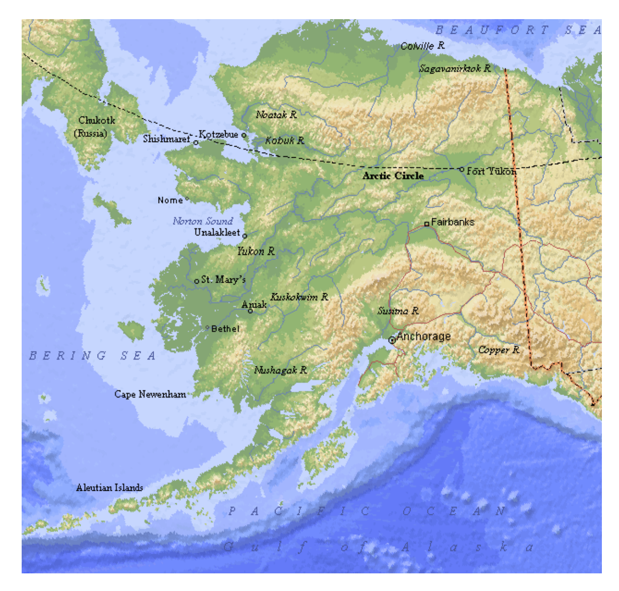
FIGURE S-1 Map of Alaska, showing the Arctic-Yukon-Kuskokwim region. The region of concern for the purposes of this study includes the Yukon River drainage, the Kuskokwim-Goodnews drainage, and the drainages between Shishmaref in the north and Cape Newenham in the south. The area of study does not include North Slope drainages and the northern part of the Northwestern region drainages.

AYK SSI. It is intended to identify the best way to investigate and understand this complex system and ultimately to devise a means to anticipate or predict future sizes of salmon populations.