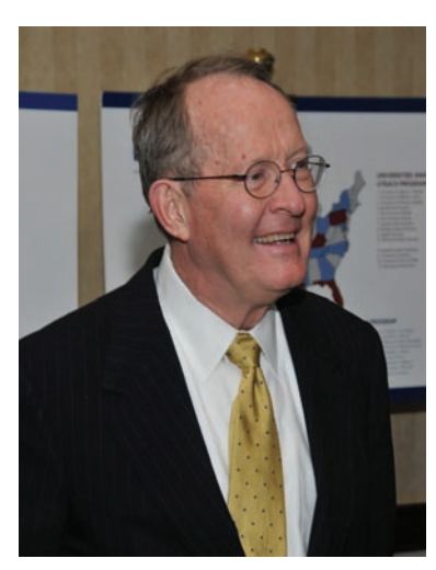
Sen. Lamar Alexander

Today, the issues associated with climate change and dependence on foreign sources of oil pose an equally great challenge, and several speakers at the symposium urged that energy security be the rallying cry for a new national commitment to science, technology, engineering, and mathematics. "The goal," said Senator Lamar Alexander of