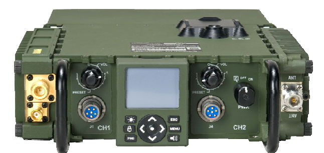
FIGURE 20 General Dynamics JTRS HMS Manpack.

As seen in Figure 20, the JTRS HMS manpackable radio is a two-channel SDR capable of network-centric connectivity and legacy interoperability, supporting advanced and current-force waveforms. The JTRS HMS has a frequency range of 2 MHz to 2.5 GHz and a maximum power output of 20 W. Weight is 14.5 lb (with battery), size is 400 cu. in., and it has fully programmable COMSEC and TRANSEC interoperability. Waveforms include SRW, MUOS, SINCGARS, EPLRS, SATCOM, and HF SSB w/ALE. General Dynamics is the prime contractor.