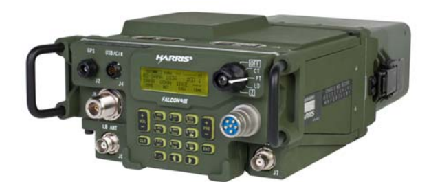
FIGURE 12 Falcon III AN/PRC-117G(V)1(C) is manpackable.

As seen in Figure 12, the Falcon III AN/PRC-117G(V)1(C) is manpackable. Manufactured by Harris Corporation, it is a tactical radio with a frequency range of 30 MHz to 2 GHz and has adjustable transmit output power of 10 W VHF and 20 W UHF. The AN/PRC-117 weighs 10.9 lb, has dimensions of 7.4 in. (W) by 3.7 in. (H) by 13.5 in. (D) (with battery), and is submersible to 1 m. Waveforms include SINCGARS, HAVEQUICK II, VHF/UHF AM and FM, high-performance waveform, MIL-STD-188-181B SATCOM, and the Harris Adaptive Networking Wideband Waveform (ANW2).