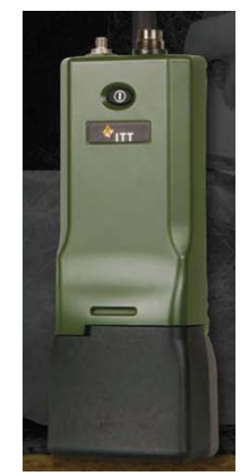
FIGURE 17 SpearNet Team Member Radio.

As seen in Figure S-17, the SpearNet Team Member Radio, manufactured by ITT Industries, is optimized for digital, network-centric communication, providing a seamless, self-healing ad hoc networking and multihop routing capability. Standard interfaces include Ethernet, USB, RS-232, and Bluetooth, and it has embedded GPS. It has a 1.2 GHz operating band with transmit power up to 26 dbm. The radio weighs 1.5 lb and has dimensions of 7.72 in. (H) by 2.99 in. (W) by 1.20-1.87 in. (D).