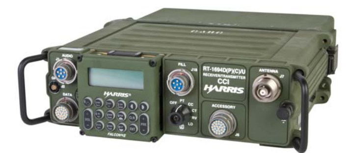
FIGURE 6 AN/PRC-150.