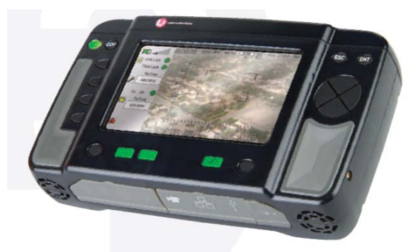
FIGURE 3 ROVER 5 handheld.

As seen in Figure 3, the ROVER 5 handheld, also manufactured by L-3 Communications, Communication Systems-West, is a portable transceiver device that provides sensor-to-shooter connectivity with the highest levels of collaboration. It is interoperable with Ku-band (14.4-15.35 GHz, 1.0 MHz steps), C-band (4.40-4.950 GHz, 1.0 MHz steps, and 5.25-5.85 GHz, 1.0 MHz steps), S-band (2.2-2.5 GHz, 0.5 MHz steps), L-band (1.71-1.85 GHz, 0.5 MHz steps), and UHF (400-470 MHz) among others. The receiver weighs 3.5 lb and measures 9.5 x 5.6 x 2.25 in. (with antenna). A lithium-polymer battery provides 2.5-3 hours of operation.