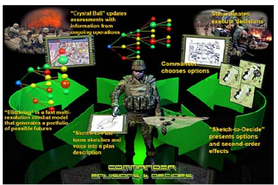
FIGURE 1 Basic system architecture for DARPA Deep Green.