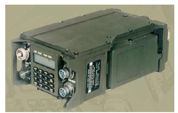
FIGURE 14 SINCGARS SIP (ASIP).

(H) by 5.3 in. (W) by 10.15 in. (D). It has integrated COMSEC and data rate adapter with embedded internet controller and SAASM GPS options.