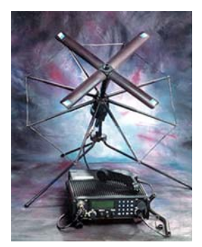
FIGURE 7 AN/PSC-5C MBMMR.

As seen in Figure 7, the AN/PSC-5C MBMMR, manufactured by Raytheon, is a lightweight, multiband/multimission terminal supporting critical tactical communications with a frequency range of 30-420 MHz operating in VHF and UHF. The transmitter has power outputs of 1 W, 5 W, and 20 W; dimensions are 3 in. (H) by 8.5 in. (W) by 10 in. (D). It weighs 10 lb and has a nominal power output of 12 W. COMSEC interoperability includes TS KG84C, KY57, and ANDVT/KYV-5. Waveform interoperability includes LPC-10 (ANDVT), MELP, SINCGARS, and HAVEQUICK I/II.