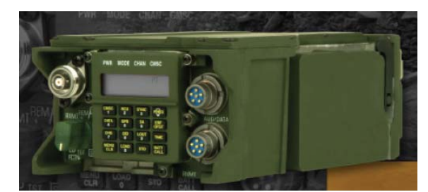
FIGURE 13 SINCGARS RT-1523.

As seen in Figure 13, the SINCGARS RT-1523, manufactured by ITT Industries, is designed to provide network data services in both mounted and dismounted configurations to allow access to the Tactical Internet. The radio has a frequency range of 30-88 MHz with transmitting power options of 1 mW, 100 mW, and 5 W dismounted and 50 W mounted RF power amplifier (RFPA). With embedded battery, the radio weighs 7.7 lb; dimensions are 3.4 in. (H) by 5.3 in. (W) by 10.15 in. (D).