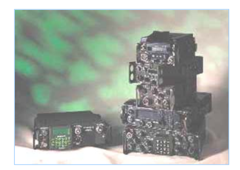
FIGURE 5 AN/PRC-117F/C.

As seen in Figure 5, the AN/PRC-117F/C, manufactured by Harris Corporation, is a multiband voice radio for a variety of military operations and has a frequency range of 30-512 MHz operating in the VHF-low, VHF-high, and UHF bands. The transmitter has a power output of 1-20 W; dimensions are 3.2 in. (H) by 10.5 in. (W) by 9.6 in. (D). The device weighs 12 lb and has a nominal power of 12 W. COMSEC interoperability includes TS KG84C, KY57, and ANDVT/KYV. Waveform interoperability includes AM/FM/PSK/CPM, SINCGARS ECCM, HAVEQUICK I/II, UHF DAMA/IW-HPW, and CTSS Tones. The radio has a removable keypad.