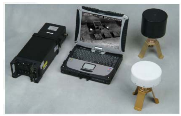
FIGURE 2 ROVER III.

L-band analog (1.71-1.85 GHz), Predator, Shadow, Dragon Eye, Litening Pod, and other joint and coalition assets. The receiver weighs 10.25 lb and measures 3.8 in. x 5.5 in. x 15.5 in. (with battery). A single BA 5590 battery provides 10-12 hours of operation.