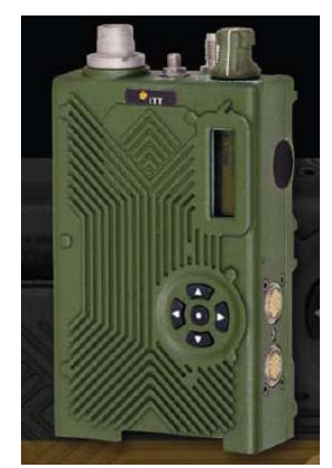
FIGURE 16 Soldier Radio. SOURCE: ITT Industries.

As seen in Figure 16, the Soldier Radio, manufactured by ITT Industries, is an SDR designed for PTT voice and data communications. Soldier Radio supports narrowband and wideband waveforms with a frequency range of 30-88 MHz (VHF), 225-970 MHz (UHF), and 1650-1850 MHz (L-band). Programmable transmit power is 1 mW to 5 W in ~6 dB steps. Weight is less than 2.2 lb; dimensions are 5.99 in. (H) by 3.75 in. (W) by 1.9 in. (D).