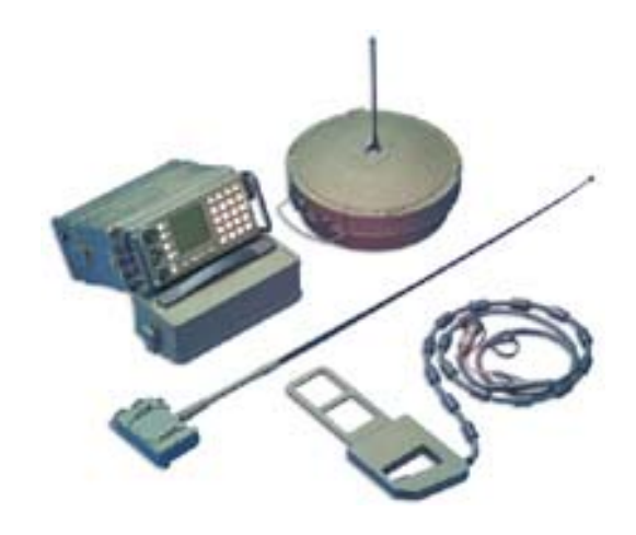
FIGURE 4 AN/PRD-13v2.

As seen in Figure 4, the AN/PRD-13v2, manufactured by L-3 Communications, Linkabit, is a manportable SIGINT system incorporating sophisticated RF intercept and direction finding processing capabilities into a low-power, lightweight, ruggedized, reliable system that satisfies the most demanding tactical applications and mission requirements. The system has a frequency range of 2-2000 MHz operating in the HF, VHF, and UHF bands. The transmitter has a power output of 9.5 W and weighs 43 lb, including an MB-5700 NiCd battery and all field accessories.