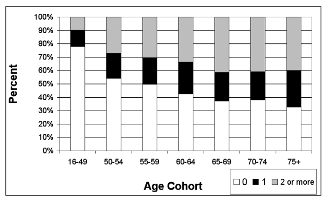
FIGURE 1 Proportion of crash-involved drivers within each age cohort taking none, versus one, versus multiple (two or more) PDI medications at time of crash.

As indicated in the following figures, the rate of use of multiple PDI medications by crash-involved drivers climbs with age until leveling off at the ages 65–69 cohort. Another perspective on these data is provided by the following graphics, which look more narrowly at the contrast between zero, one, and multiple drug usage. Figure 1 presents these relationships in a bar graph, whereas Figure 2 focuses more closely on the changes in multiple drug use with driver age.