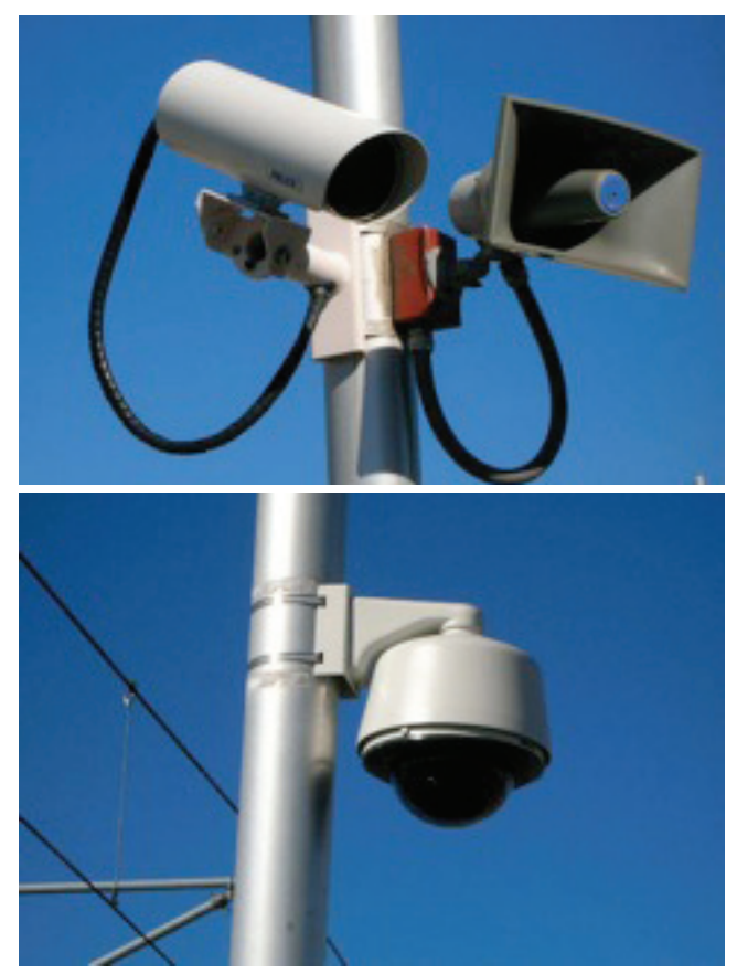
FIGURE 5 Fixed cameras (top) are being replaced with pan-tilt-zoom (PTZ) cameras (bottom). PTZ cameras provide greater surveillance coverage because they can pan (move left and right), tilt (move up and down), and zoom in or out.

Despite opening for revenue service with a well-designed video surveillance system, Metro Transit has been upgrading its system almost since its inception. The initial system was based on almost 130 cameras that were installed at the 17 original stations and two parking lots. The at-grade and elevated stations have canopies and windscreens and overhead radiant heaters. Each station is furnished with emergency call boxes, maps, information kiosks, public art, and benches. Fare collection is a self-service, barrier-free proof of payment system that is checked periodically by Metro Transit police officers. Each station, with the exception of large facilities (i.e., Mall of America, Lindbergh Airport Terminal, and Lake Street Station) was designed with four cameras per station. Cameras also monitored the portals into the tunnels on S. Hiawatha and Minnehaha and at the airport. With the exception of one pan-tilt-zoom camera (Figure 5) at Fort Snelling, all others were fixed-position cameras.