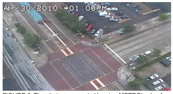
FIGURE 6 The photo represents Houston METRO's plan for installation of video analytics to detect illegal left turns by road vehicles into the LRV's right of way.

A number of safety improvements, including new signage, better signal layout, public education, and media attention to the problem, contributed to reducing the number of incidents involving road vehicles and LRVs. The use of analytic video adds another layer of protection to riders in both the railcars and other vehicles as well as to pedestrians, who may also be injured if accidents occur (Figure 6).