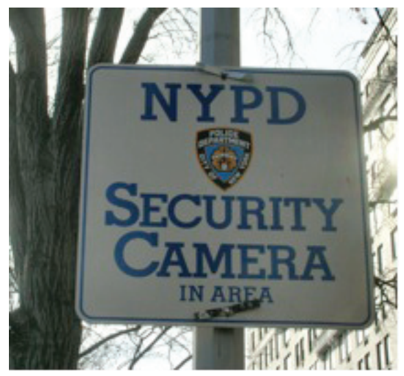
FIGURE 4 The New York City Police Department posts signs on local streets indicating the presence of security cameras. This sign was across the street from a Manhattan subway station.

The use of surveillance in the United States is not as widespread as it is in the United Kingdom, but it has been steadily expanding. It is not unusual for newspaper readers around the nation to see stories about their cities increasing their reliance on cameras for a number of crime prevention efforts. New York City, Chicago, Baltimore, and Pittsburgh are only a few of those whose mayors have spoken frequently on the issue, and many smaller cities have turned to cameras without the fanfare and publicity of these larger municipalities (Figure 4). Announcements of transit agencies' expansion of their surveillance networks also receive local attention from the media.