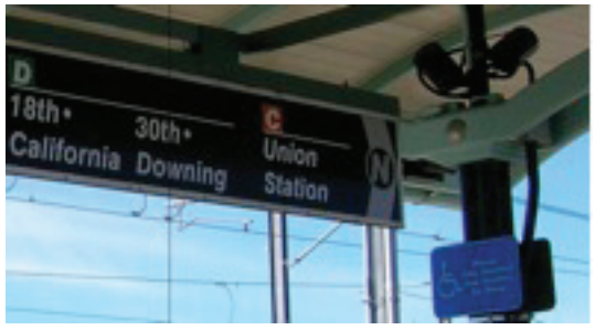
FIGURE 3 Denver's RTD places cameras near handicapped access ramps.

Houston METRO is one of a large number of agencies that monitor park-and-ride facilities to prevent a variety of crimes, including vehicle thefts and thefts from vehicles. Cameras also can be used to observe that patrons are not annoyed by panhandlers or do not become the victims of more serious crimes. Staff members who are monitoring the cameras are often able to communicate with drivers in the parking facilities and to control a number of lots' electronic gates through their central operations center (Nakanishi 2009, p. 23)