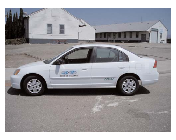
FIGURE 4 Port of Oakland CNG vehicle.