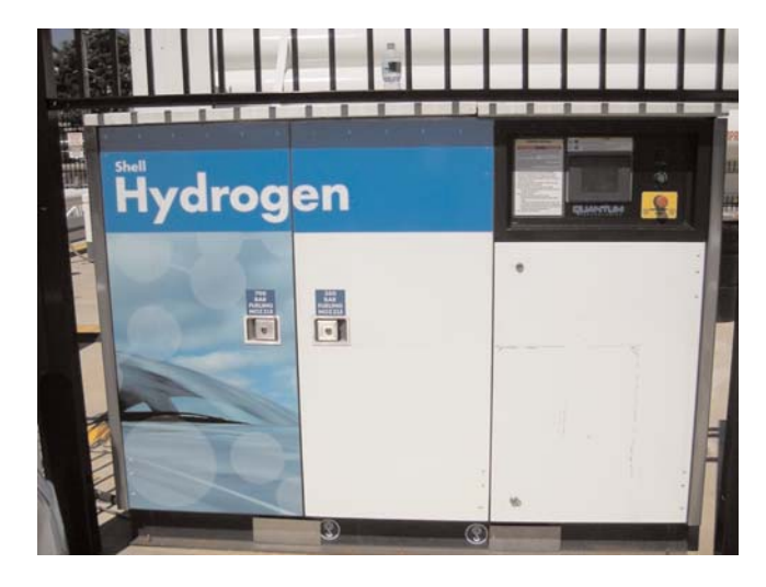
FIGURE 6 JFK hydrogen fueling station (detail).

Newark Liberty International Airport (EWR) is another commercial service airport operated by the PANYNJ. EWR took advantage of a program offered by the Public Service Gas and Electric Company (PSE&G) to reduce energy consumption at little cost to the airport. EWR relied on PSE&G's Direct Install Program to install three chillers with variable speed drives and to replace lighting with more efficient fixtures. PSE&G performed the installation and paid for 100% of the equipment and installation costs. EWR is obligated to pay back only 20% of these costs through the airport's regular utility bill. Thus, PSE&G is paying for 80% of the cost of