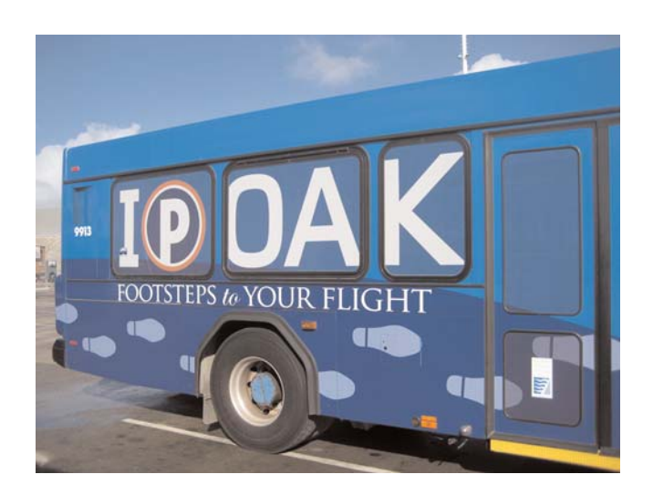
FIGURE 3 Oakland International Airport retrofit bus.

As the applicant and grantee, CALSTART is responsible for all financial aspects of the grant and the project, including submitting reports to EPA and processing payment requests. As a sub-recipient, OAK is responsible for executing a sub-recipient agreement, paying the vendor and invoicing CALSTART.