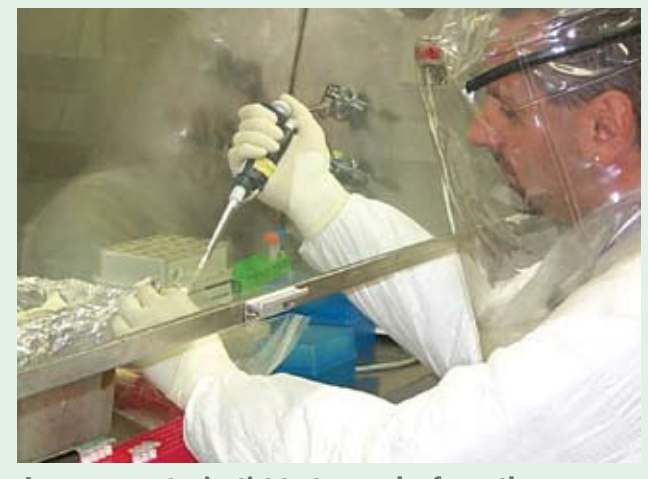
A government scientist tests samples for anthrax following the letter attacks in 2001.

B. anthracis spores, taken from the letter sent to the New York Post and postmarked September 18, 2001, are prepared for analysis.