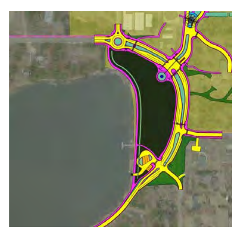
Figure 4. Map of proposed change to Crystal Boulevard.

popular recreational destination, as well as improving water quality in Crystal Lake. (This project requires approval by the Itasca County Agricultural Board, which has reservations about the project.)