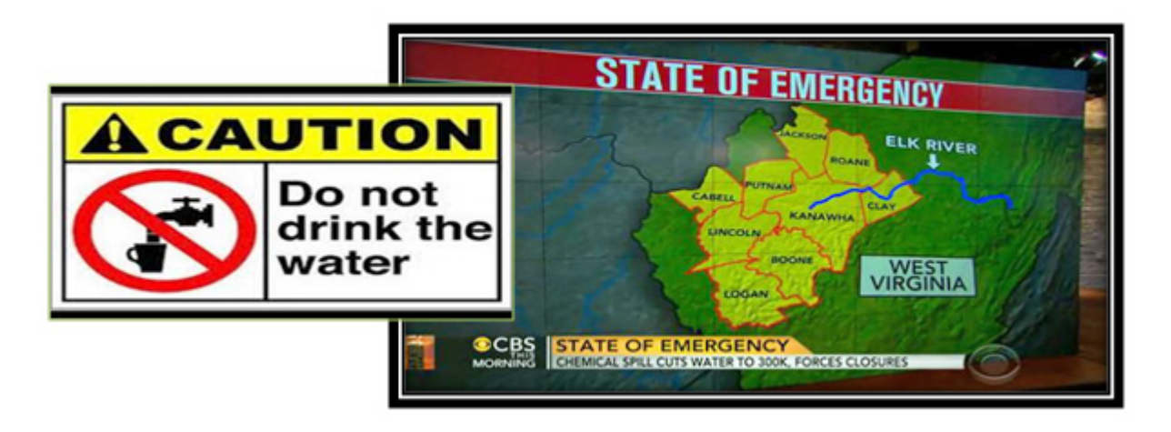
FIGURE 1 Map of West Virginia counties affected by the January 2014 chemical spill.