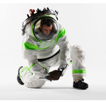
FIGURE 4 Z-2 suit design with luminescent patches.