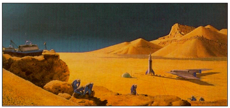
FIGURE 3 An illustration from Exploring Mars by Chesley Bonestell, 1956. SOURCE: Reproduced courtesy of Bonestell, LLC.

The major issues missing are the discussions of task-analytic data (a deficit shared by other NASA evidence reports) and discussion of an alternative to conventional EVA suit design. Additional gaps include discussions regarding the mechanisms for mitigating the effects of pressure-suit punctures and the effects of physiological deconditioning on human performance during EVAs in pressure suits. In the absence of task-analytic data, details are not available on the work that will be performed on the surfaces of asteroids and Mars; however, it is reasonable